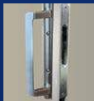
Contemporary satin nickel