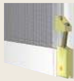
Patented spring-loaded suspension system